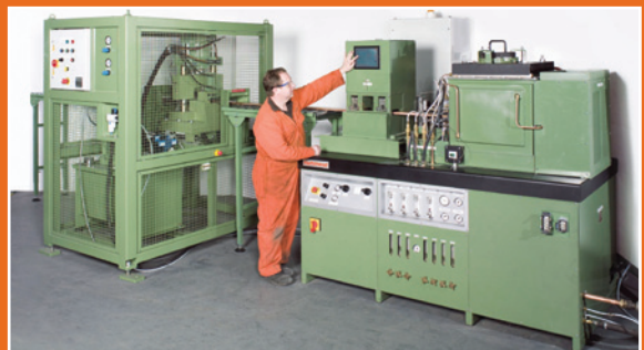
RMJ/H 025 with In-Line Shear