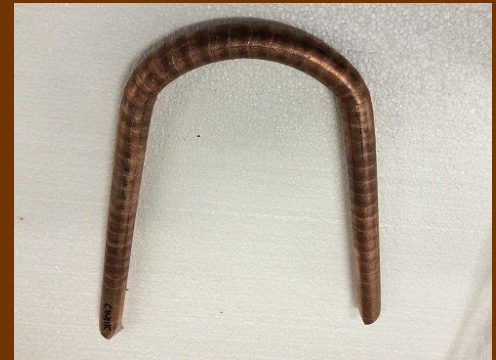
Bend test of "as cast" rod

Compositon: Cr 0.65% Zr 0.055% bal. Cu Rod diameter: 28mm Cast at: 250 kg/hr/strand