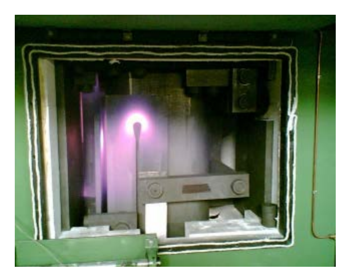
fig. 6 graphite heating elements