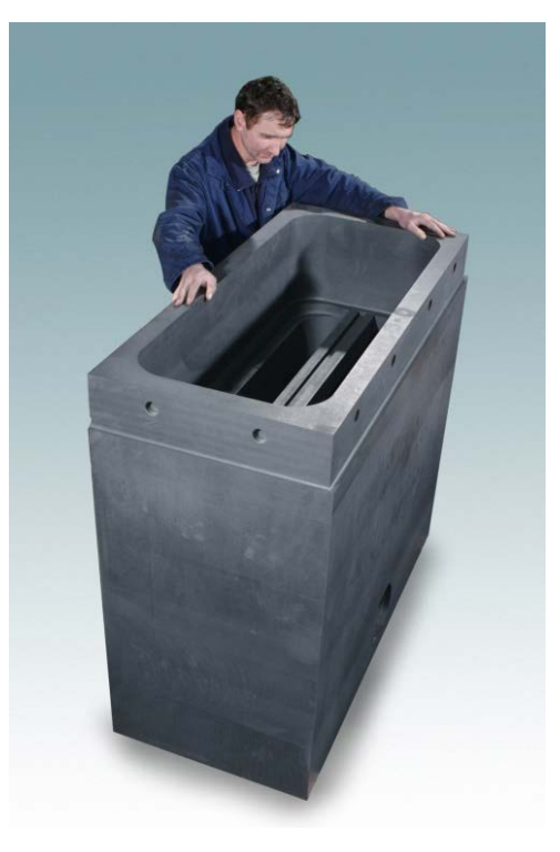
fig.5 graphite crucible

The Furnace crucible for CuMg applications is machined from a vibration-moulded solid block to form a homogenous containment vessel, with two inter-connecting chambers. Copper cathodes are automatically and progressively lowered into the melting chamber. The molten metal flows with gravitational force through ports in the base of the crucible to the separate casting chamber. Sacrificial linings are used to protect exposed surfaces from oxidation. The naturally reducing effect of the graphite material assists in ensuring the full de-oxidation of copper and avoids contact with and contamination of the melt by refractory particles.