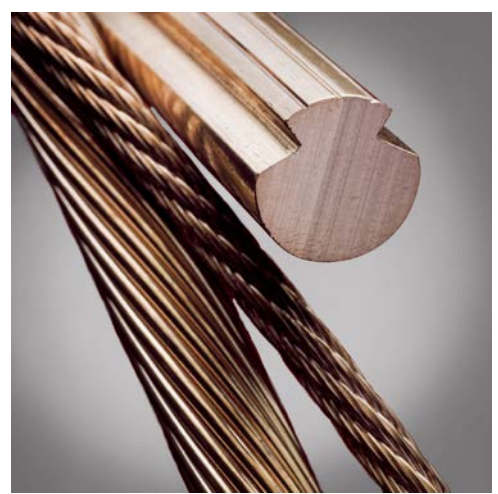
fig.2 grooved trolley wire in CuMg0.5

Overhead single strand contact wire conductors are used to transmit electrical current to drive the train via a pantograph mounted on the roof. To avoid arcing, to minimise abrasive wear and to maintain an uninterrupted supply of power, the pantograph should be in constant contact with the stationery wire. The catenary system requires to have minimum vibration and motion to ensure smooth operation at high train speeds and in strong wind conditions. It must be corrosion resistant and be able to withstand hot ambient temperature conditions. As design train speeds have increased, demands placed on performance of the catenary have risen significantly. For safety reasons, maximum train speed should not exceed 70% of the wave propagation velocity. Two means of achieving that objective are to heighten the tension in the contact wire and to adopt lightweight materials. In recent years, copper-magnesium alloys have been widely adopted as the electrical conductors in catenary systems to meet these requirements.