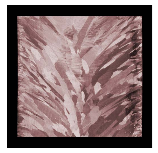
fig 1. grain structure in as cast CuMg

The upwards vertical adaptation of the Rautomead continuous casting process was developed in the early 1990s. It became apparent that upwards casting brought advantages over the horizontal process in production of many copper-based alloys, including CuMg, as well as tin-bronzes and a range of binary brasses. Crystalline structure was notably improved with enhanced tensile properties (UTS and % elongation) which benefited subsequent cold rolling or drawing. The vertical cast rod presents greatly superior structural symmetry compared with horizontally cast rod. The latter tends to lean forward owing to the uneven effects of gravity around the circumference of the solidifying metal. In the upwards vertical mode, the characteristic mix of central equiaxed grains and fine chill grains on the outer diameter remain, but the larger columnar grains were of a steeper angle towards the direction of cast, typically 50 - 70 deg. rather than 40 - 45 deg. in horizontal casting. Higher rates in casting (cooling) also led to the grains being more refined and more evenly distributed.