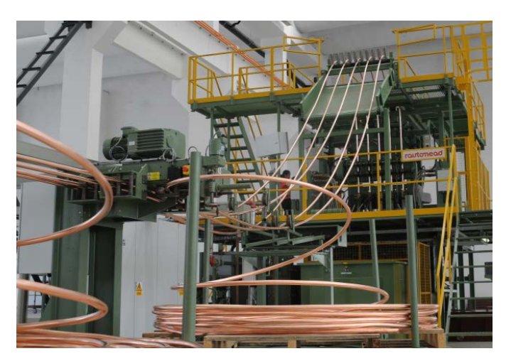
fig. 3 Rautomead RS 3000/5-CuMg Casting Machine

Rautomead offers a standard line of upwards vertical continuous casting equipment for production of a nominal 3,000 tonnes per year of CuMg wire rod. This line comprises an RS 3000/5 CuMg upwards vertical combined melting and casting machine, configured to produce five strands of trolley wire rod up to 30mm diameter and five heavy duty rod coilers. Wire rod for the single strand contact wire is cast at 28-30mm diameter. Wire rod for the stranded cable used for support wire and droppers is typically cast at 20mm diameter. Feedstock for the line is Grade A quality cathode with elemental magnesium additions. No separate melting furnace is used. Typical alloy compositions are CuMg0.1 to CuMg 0.6.