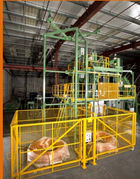
Copper Feed: 8mm CuOF Rod