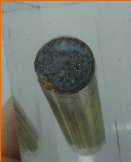
Affival: copper sheath encasing alloying powder