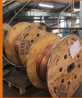
Alloy Feed: Cored Wire